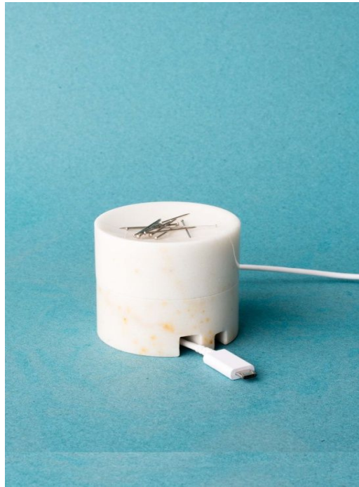
Wire Holder X Pin Holder