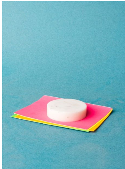
Paper Weight X Paper Holder